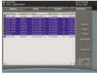
Digital network transfer